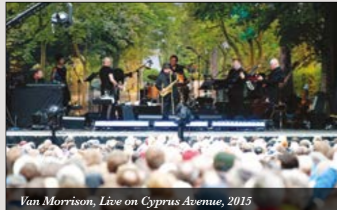
Van Morrison, Live on Cyprus Avenue, 2015