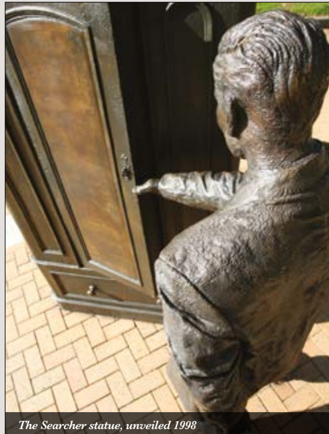
The Searcher statue, unveiled 1998

We look forward to celebrating many more milestones. In the meantime we remain committed to improving the lives of people living locally and will deliver our work in line with our adopted core values including; alleviating poverty and disadvantage, being entrepreneurial, seeking economic sustainability as an organisation, being environmentally responsible, respecting and celebrating local heritage, being inclusive and working collaboratively.