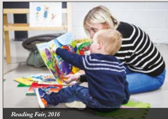
Reading Fair, 2016