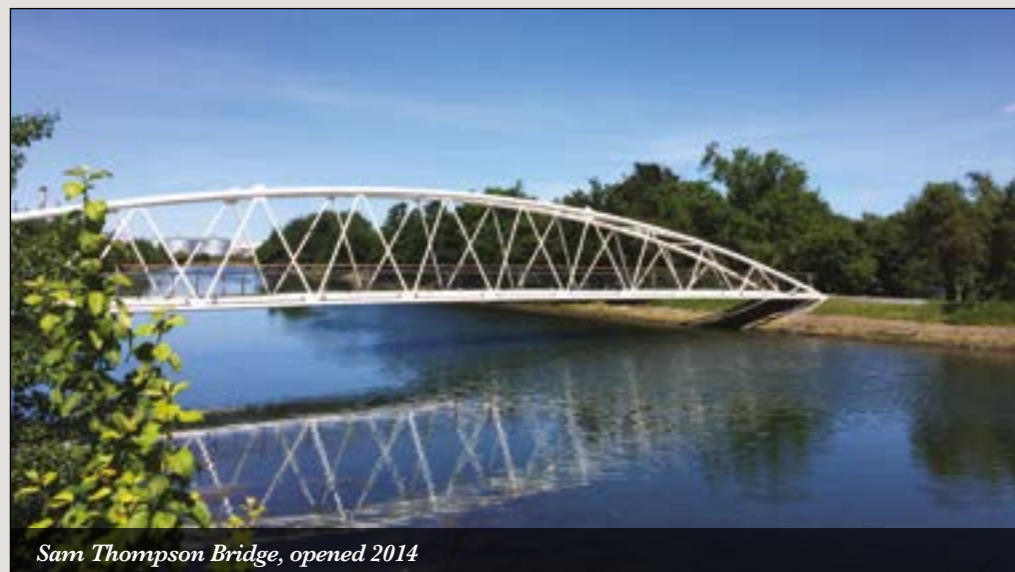
Sam Thompson Bridge, opened 2014