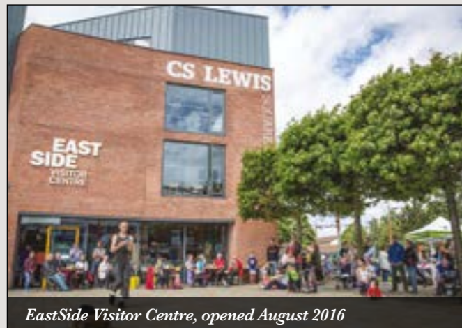
EastSide Visitor Centre, opened August 2016