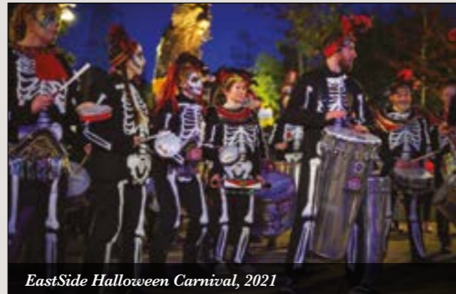
EastSide Halloween Carnival, 2021