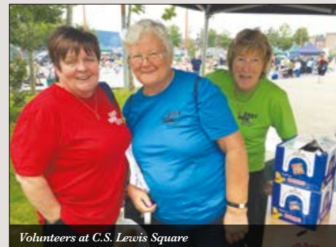
Volunteers at C.S. Lewis Square

To find out more about volunteering please visit www.eastsidepartnership.com/volunteer or call 028 9045 1900