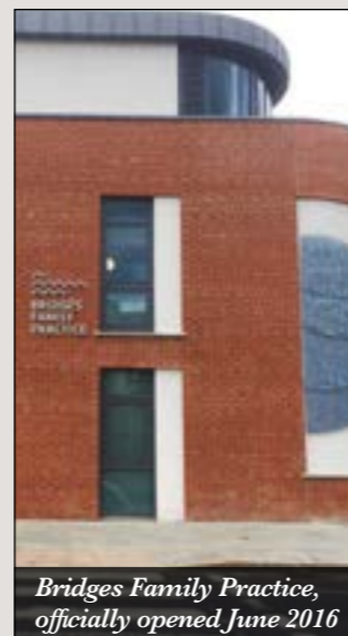
Bridges Family Practice, officially opened June 2016