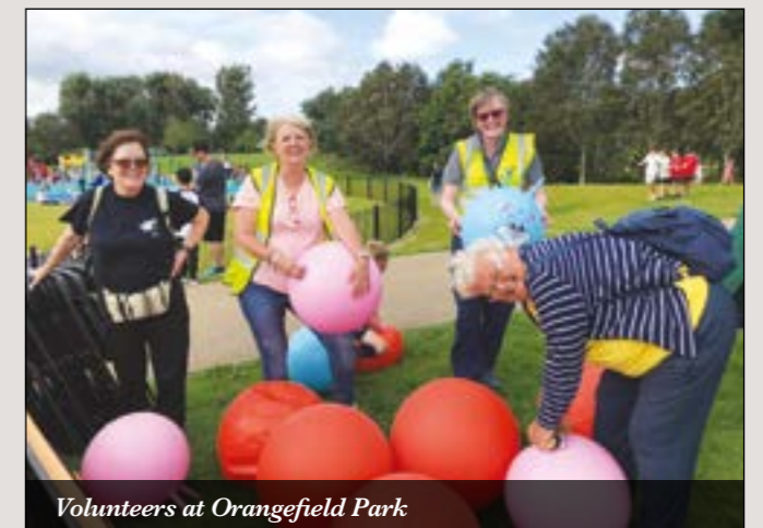
Volunteers at Orangefield Park